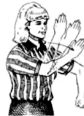
ROUGH CHECK/ILLEGAL CHECK ON BODY