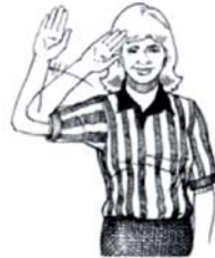
CHECKING INTO THE SPHERE