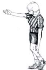
ILLEGAL BALL OFF THE BODY