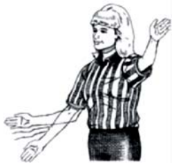
GOAL CIRCLE FOUL