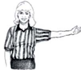
HELD WHISTLE DIRECTION OF POSSESSION