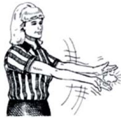
EMPTY CROSSE CHECK