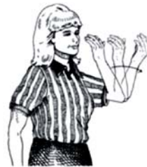
ILLEGAL CRADLE IN SPHERE