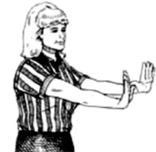
PUSHING OR BODY CONTACT