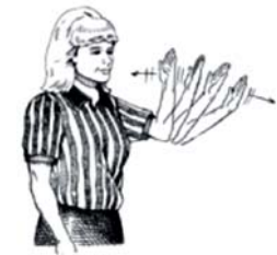
DANGEROUS SHOT ON GOALKEEPER