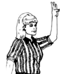
THREE SECOND RULE