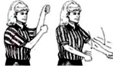
DANGEROUS FOLLOW THROUGH & DANGEROUS PROPELLING