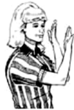
OBSTRUCTION OF FREE SPACE TO GOAL