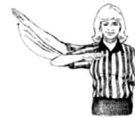
TEN SECOND GC COUNT