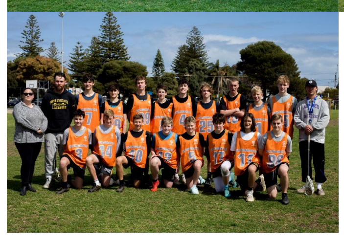
SENIOR MEN'S AND WOMEN'S STATE TEAMS